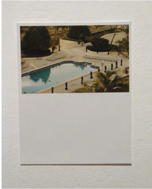
Tales 13 (Miami Beach, Florida, December 2008), 2009 Series of eight photographs, 20x 25cm