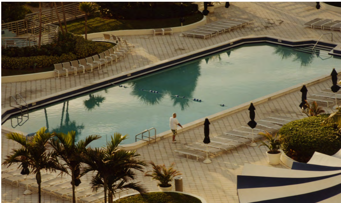
Tales (Miami Beach, Florida, December 2008), 2009 Series of photographs, each 17 x 12 cm