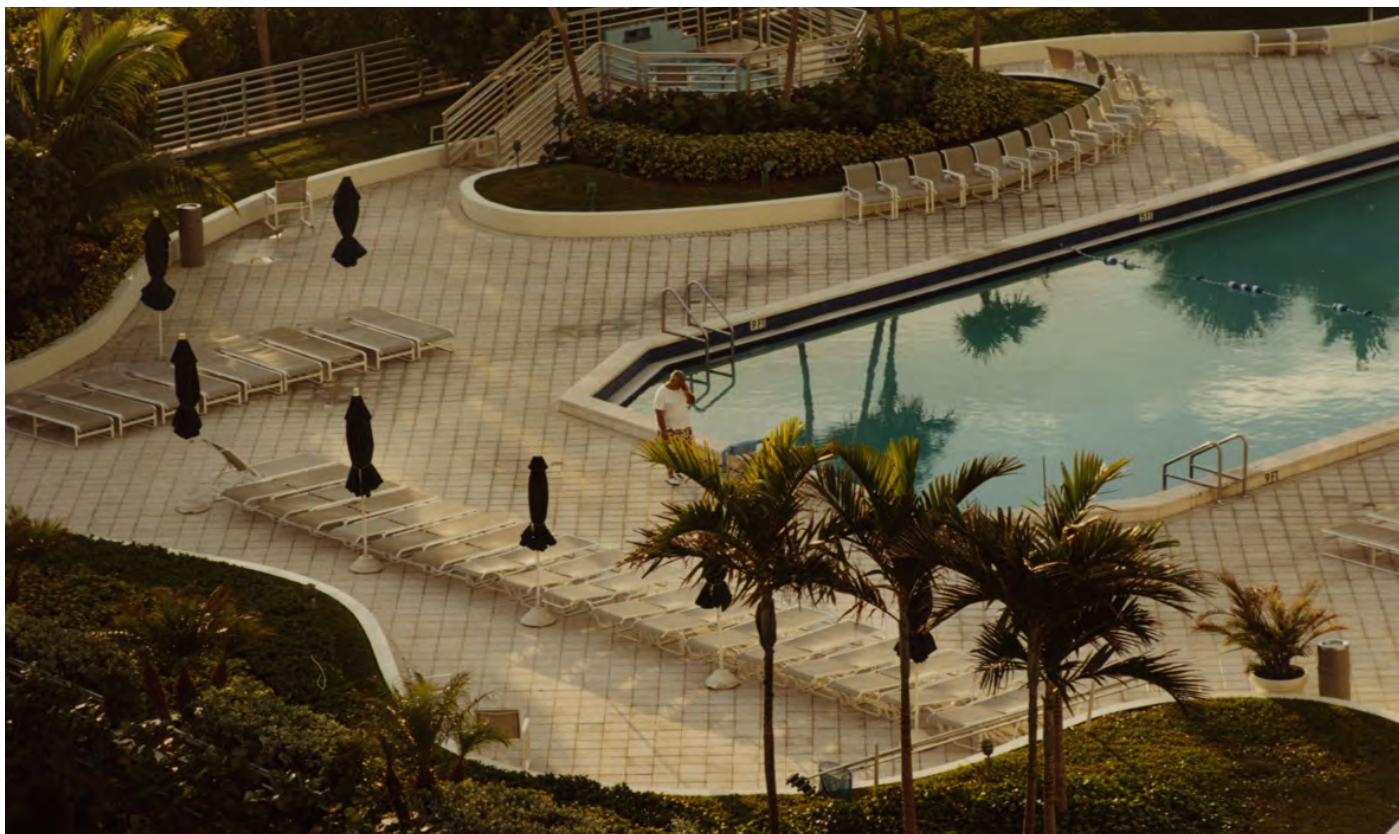
Tales (Miami Beach, Florida, December 2008), 2009 Series of photographs, each 17 x 12 cm