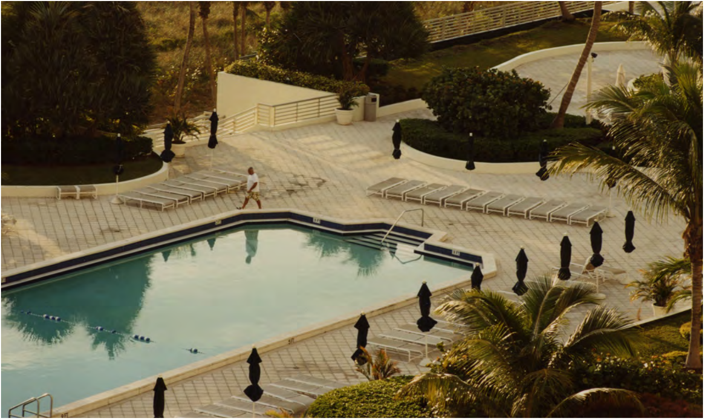
Tales (Miami Beach, Florida, December 2008), 2009 Series of photographs, each 17 x 12 cm