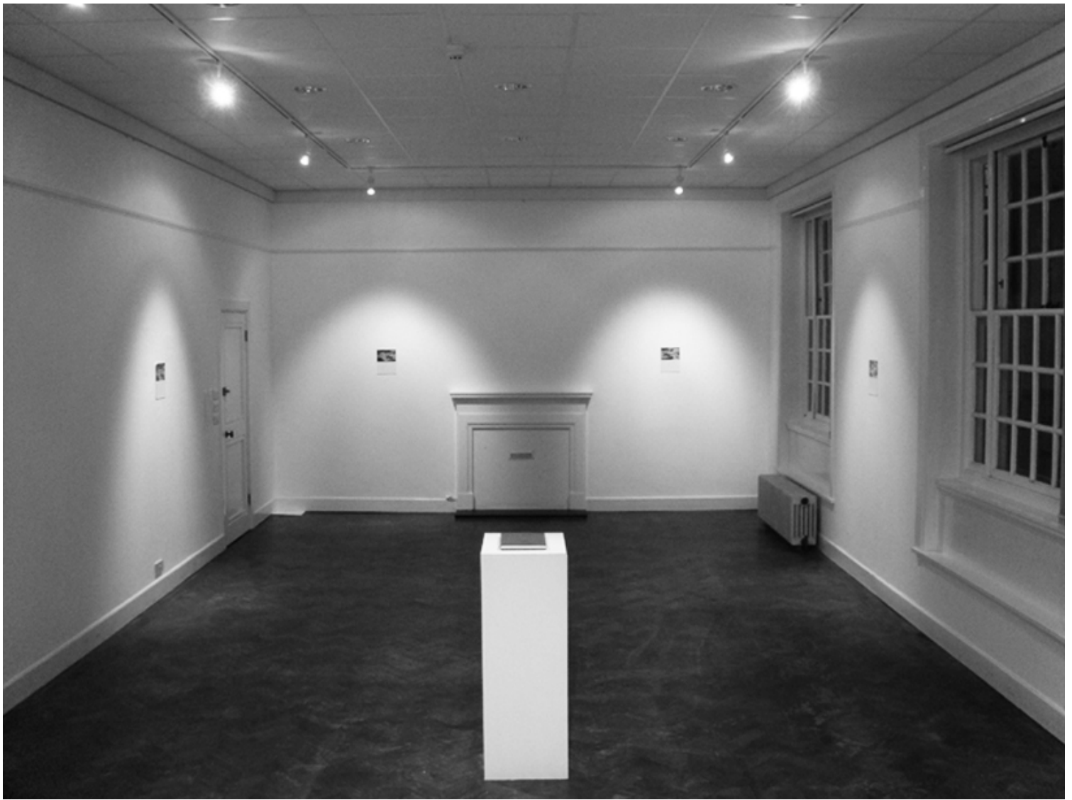
Installation view Jerwood Room