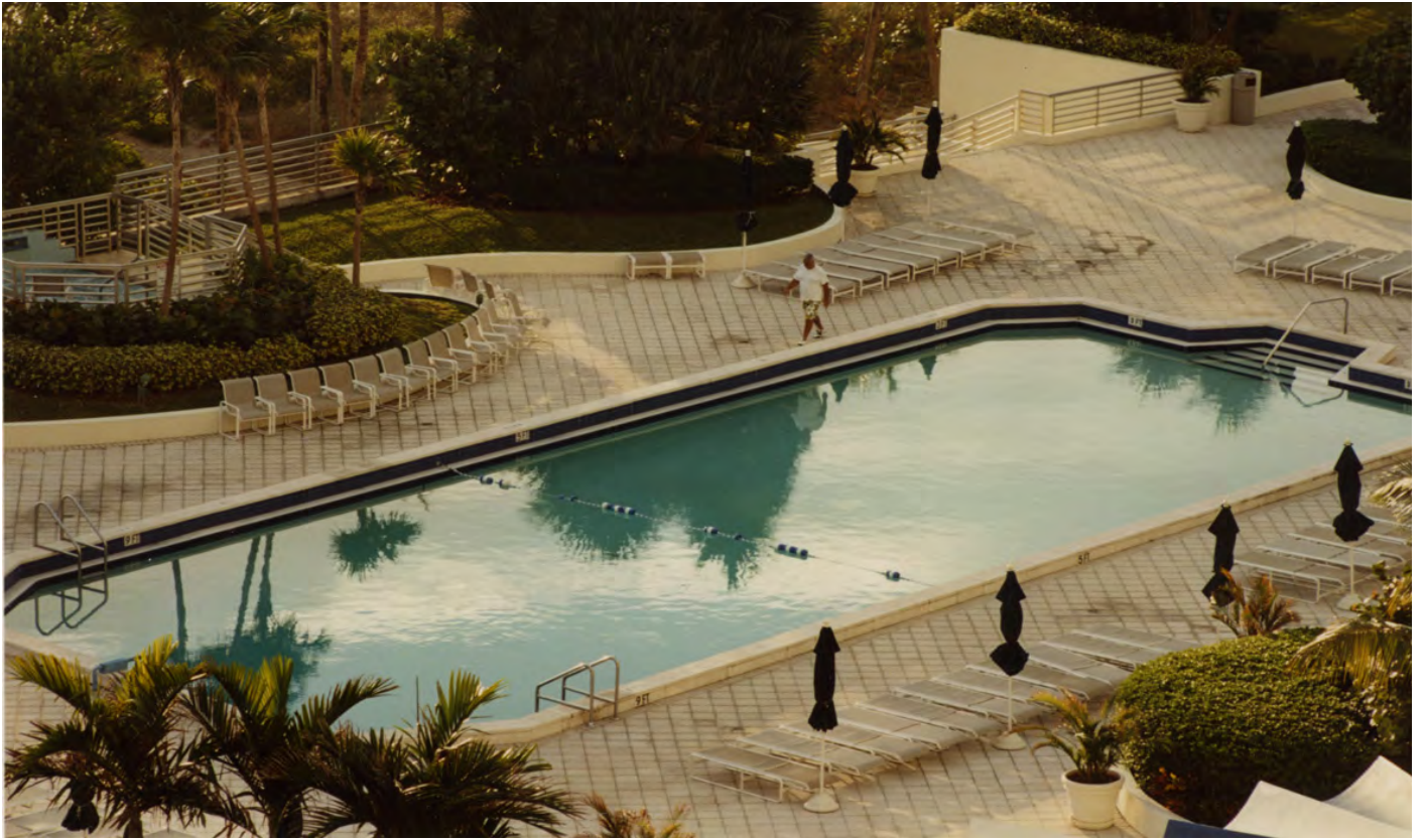
Tales (Miami Beach, Florida, December 2008), 2009 Series of photographs, each 17 x 12 cm