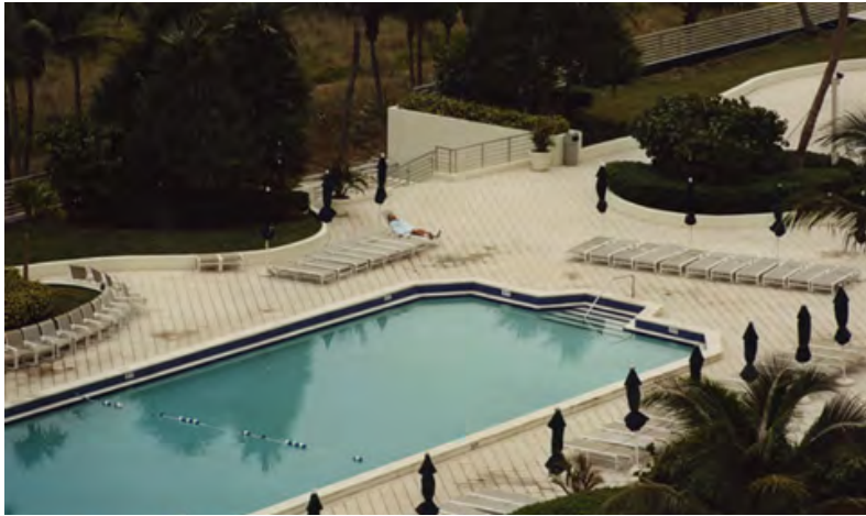
Tales (Miami Beach, Florida, December 2008), 2009 Series of 3 photographs, each 17 x 12 cm