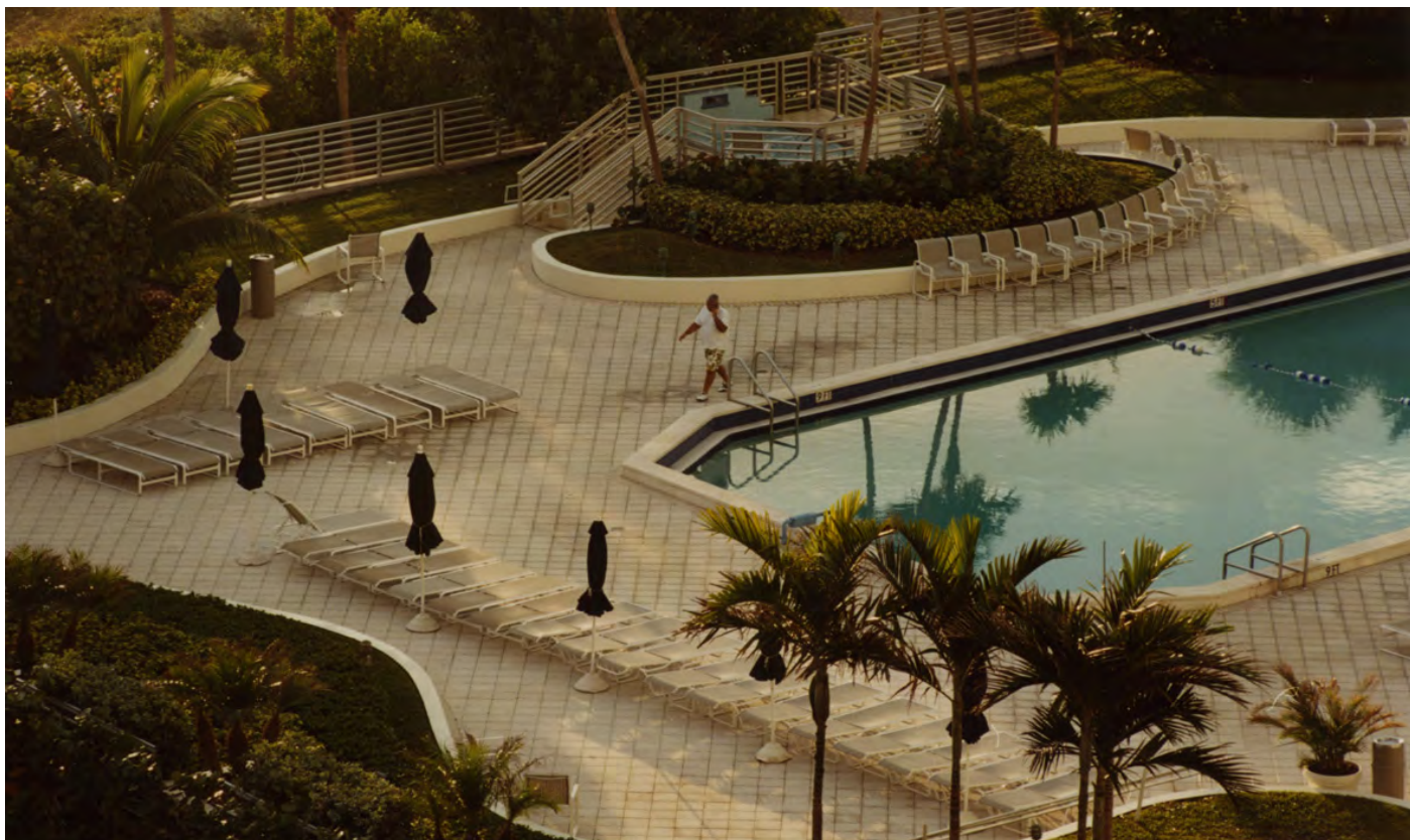
Tales (Miami Beach, Florida, December 2008), 2009 Series of photographs, each 17 x 12 cm