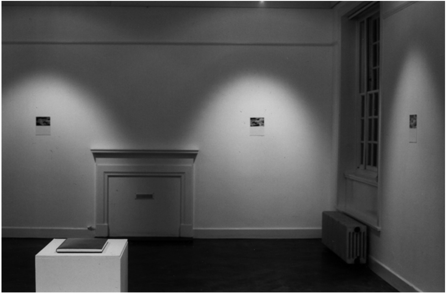
Installation view Jerwood Room, February 2009