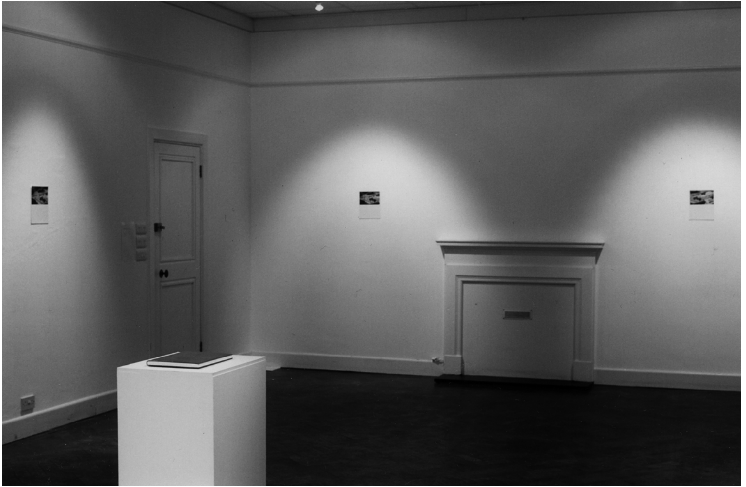
Installation view Jerwood Room, February 2009