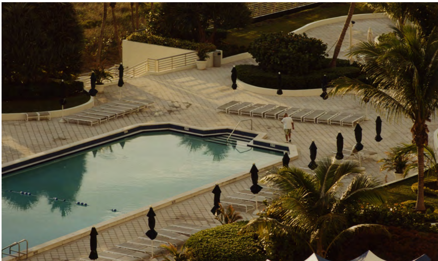
Tales (Miami Beach, Florida, December 2008), 2009 Series of photographs, each 17 x 12 cm