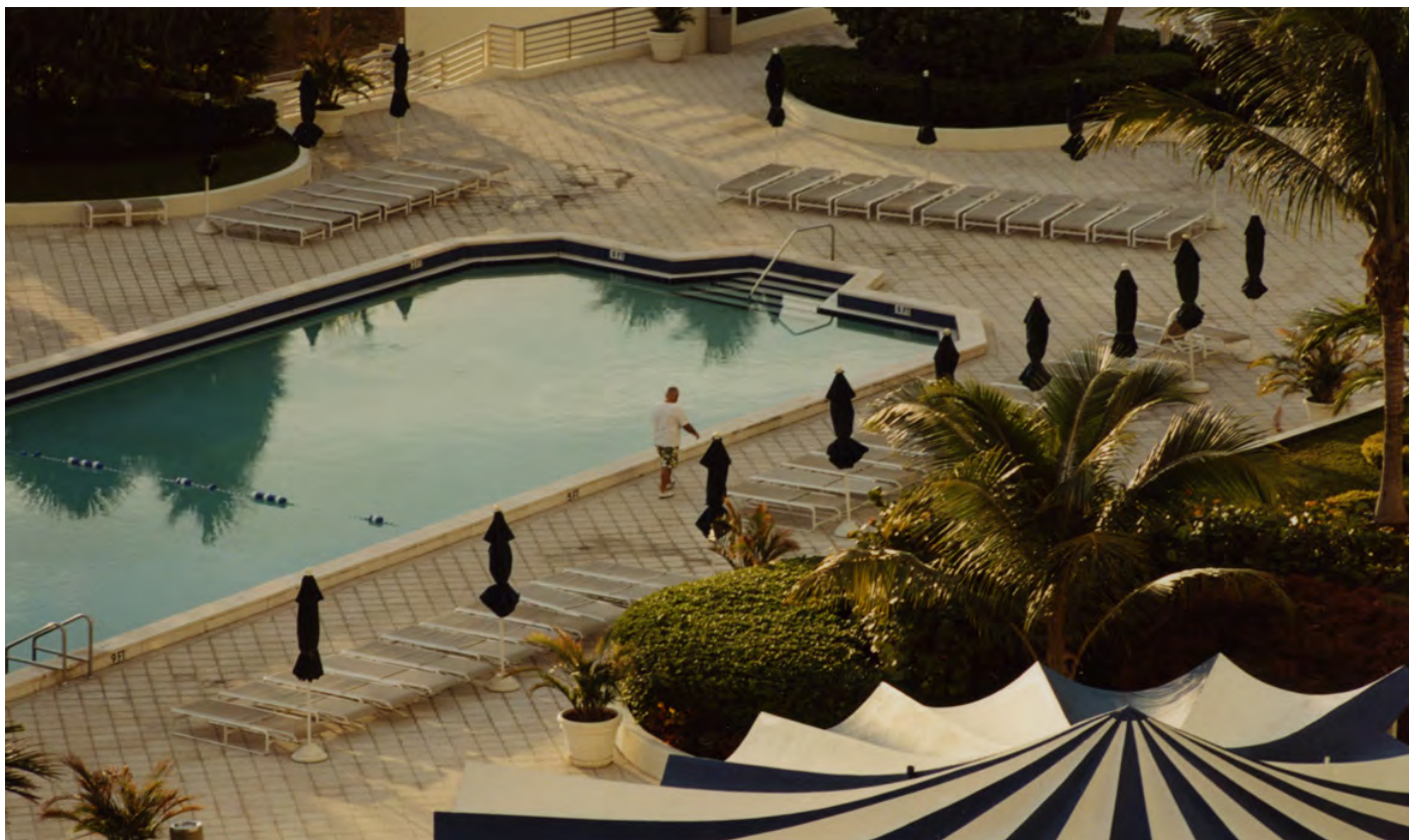
Tales (Miami Beach, Florida, December 2008), 2009 Series of photographs, each 17 x 12 cm